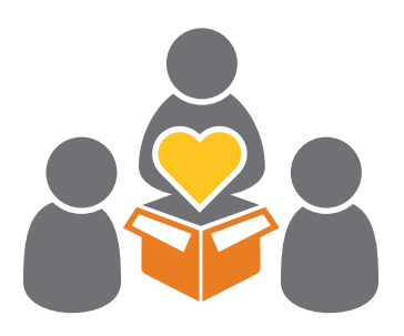
Thanks to your generosity, we'll deliver 25,000 Boxes of Love <sup>®</sup> to those families for Thanksgiving.