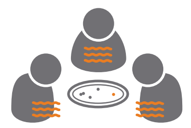
20% of American families don't have enough food over the holidays.